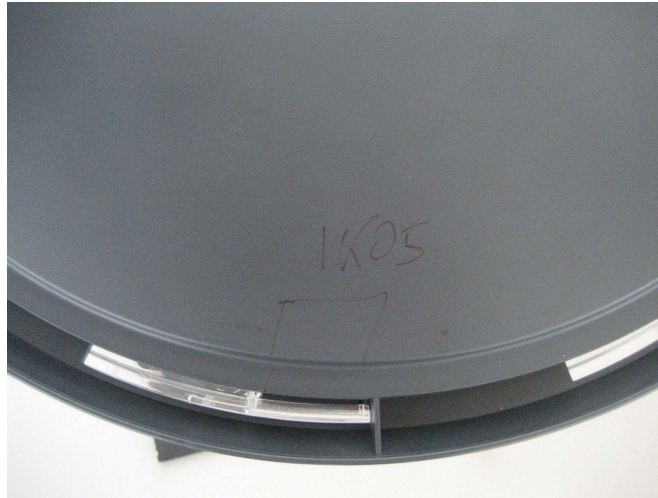
Photograph No. 7 Luminaire after IK05 (0,7J) Test.